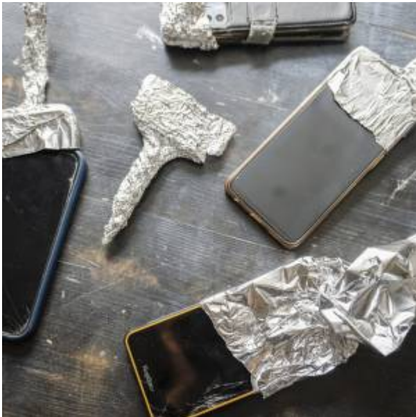
084 Sat11 Amro 24 Violetta Wakolbinger Vio3369