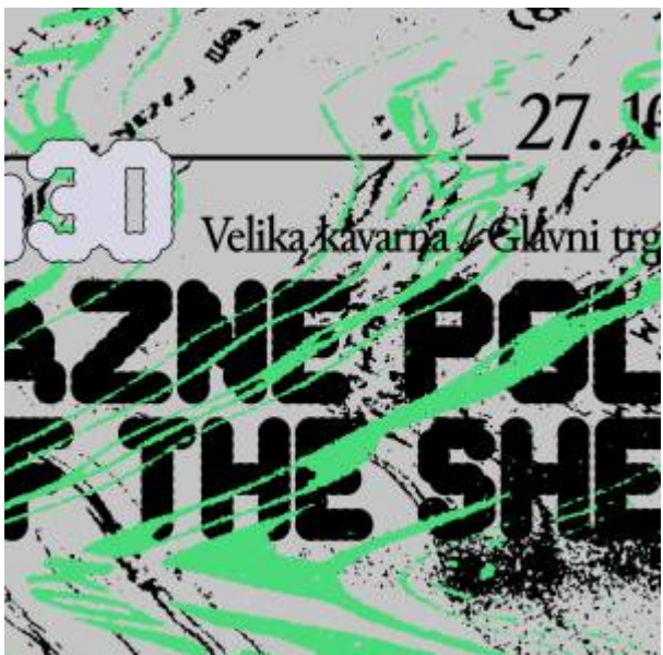
Mfru30 Fb Cover