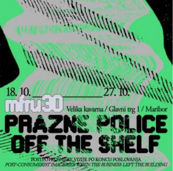
Mfru30 Save The Date 1920x1920 Fb Si-en