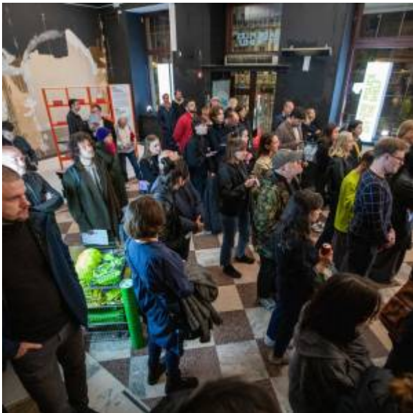
0 Ig L 47