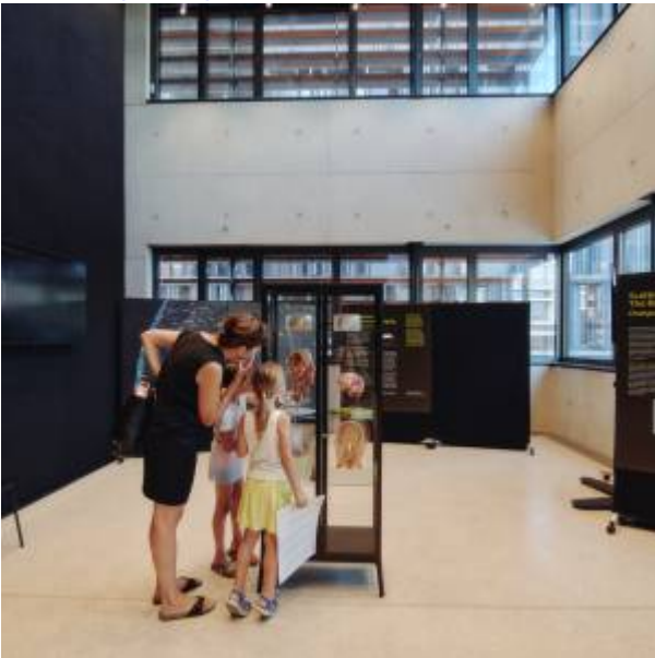
Touchingthoughts Fotodocu 65