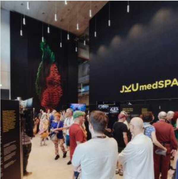
Touchingthoughts Fotodocu 32

Campus in two presentation sessions in the medSPACE and in an exhibition.