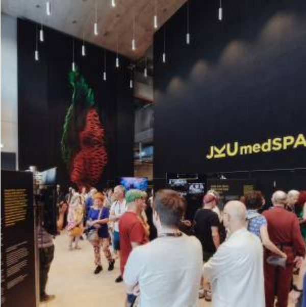
Touchingthoughts Fotodocu 32

Campus in two presentation sessions in the medSPACE and in an exhibition.