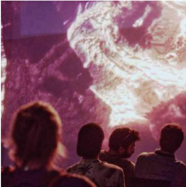
Touchingthoughts Fotodocu 134 Ph-linaa Pulido Barragan