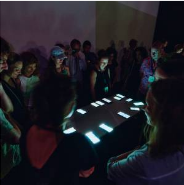
Touchingthoughts Fotodocu 100 Ph-swabiswabi