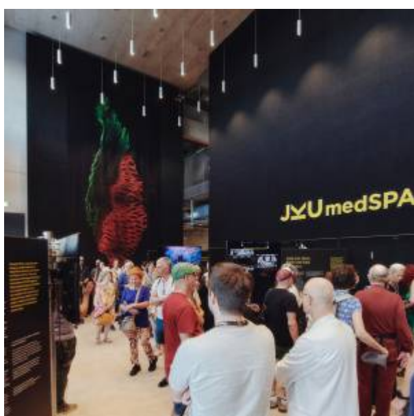
Touchingthoughts Fotodocu 32

These projects together with new images produced by the scientists and further documentation materials about the imaging protocols, are on display during Ars Electronica Festival at JKU MED Campus in two presentation sessions in the medSPACE and in an exhibition.