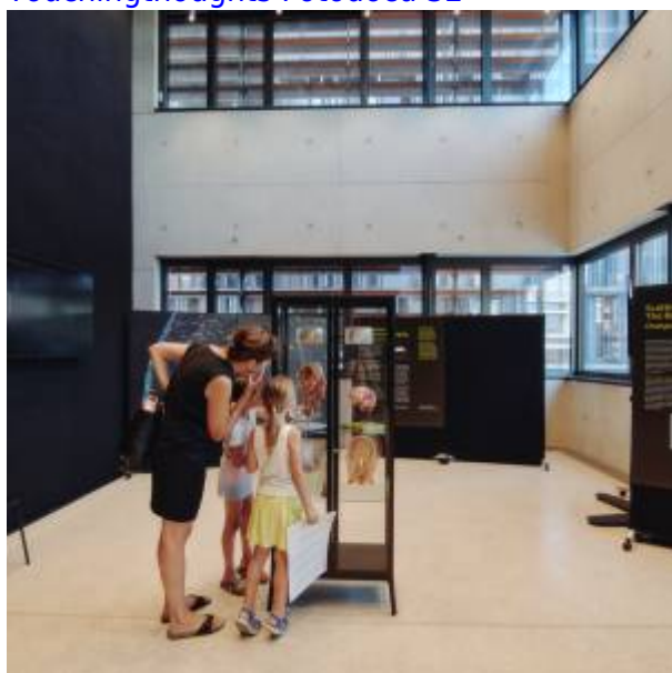
Touchingthoughts Fotodocu 65