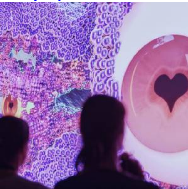
Touchingthoughts Fotodocu 137 Ph-linaa Pulido Barragan