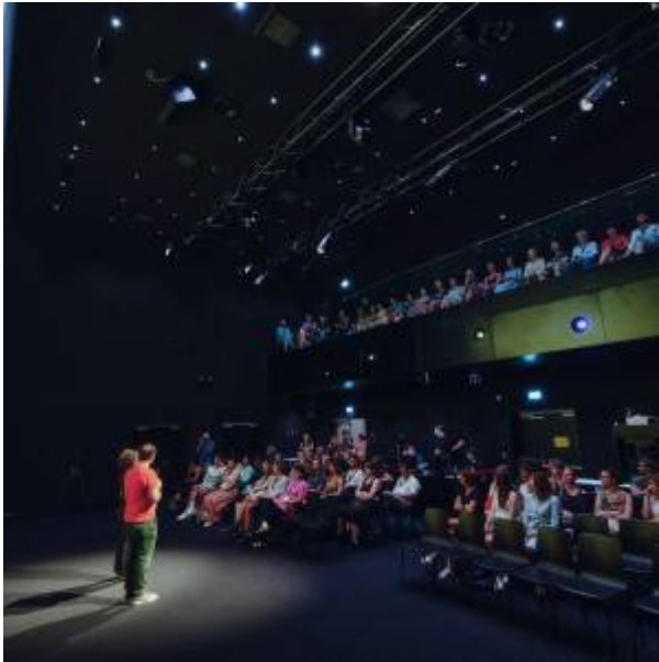
Touchingthoughts Fotodocu 74