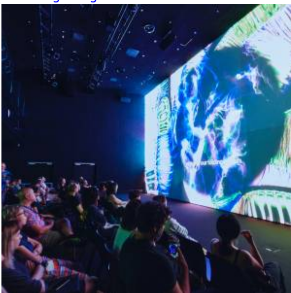
Touchingthoughts Fotodocu 91