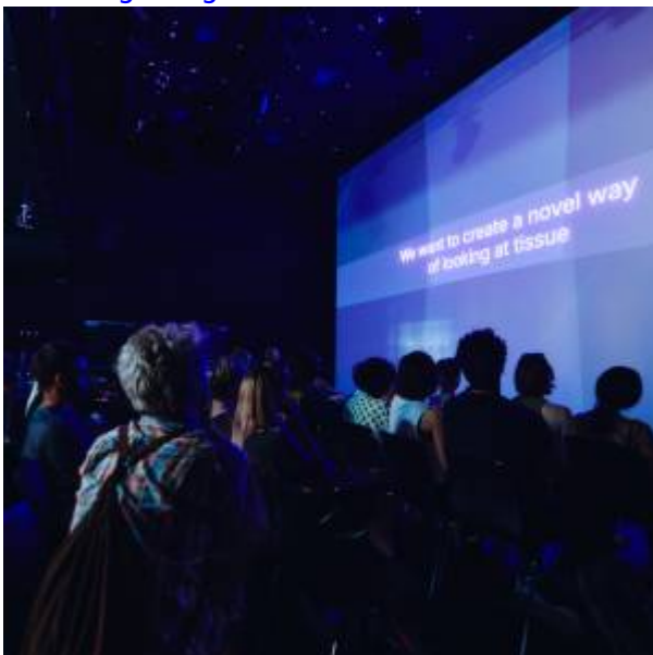
Touchingthoughts Fotodocu 83