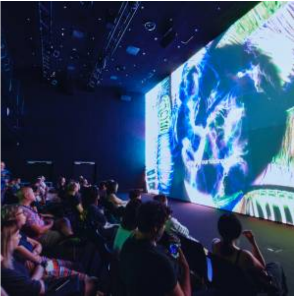
Touchingthoughts Fotodocu 91