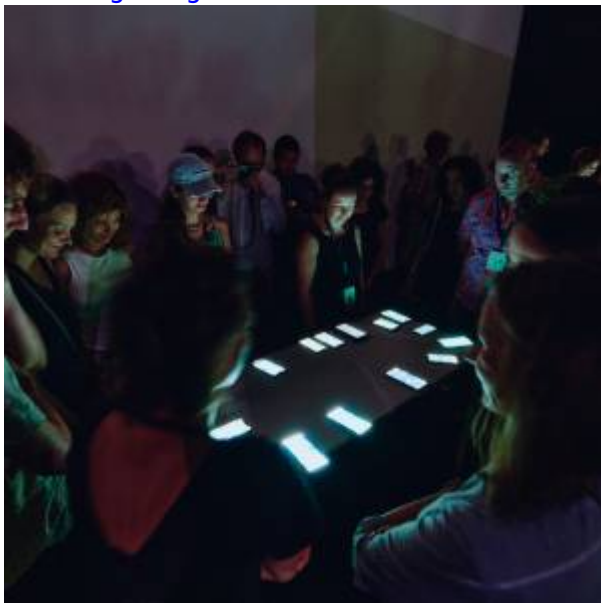
Touchingthoughts Fotodocu 100 Ph-swabiswabi