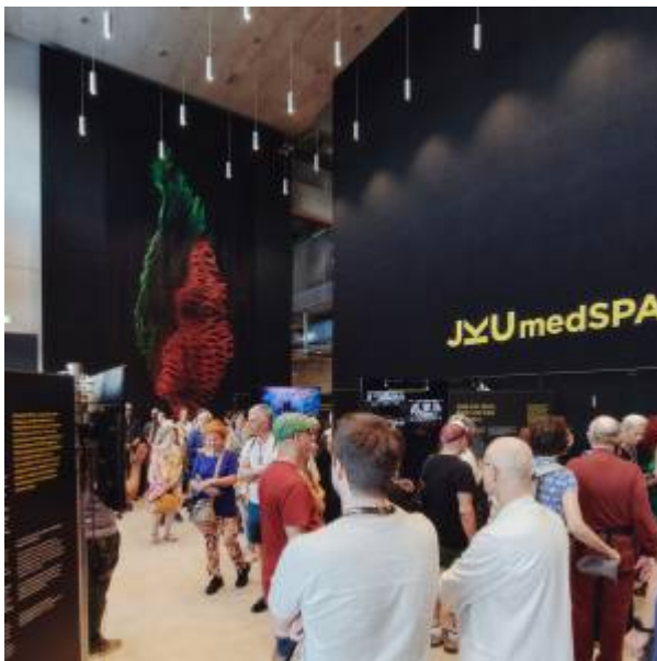
Touchingthoughts Fotodocu 32

These projects together with new images produced by the scientists and further documentation materials about the imaging protocols, are on display during Ars Electronica Festival at JKU MED Campus in two presentation sessions in the medSPACE and in an exhibition.