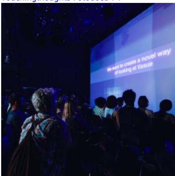
Touchingthoughts Fotodocu 83 Ph-swabiswabi