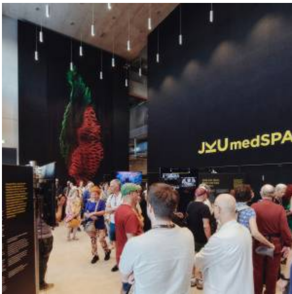
Touchingthoughts Fotodocu 32

These projects together with new images produced by the scientists and further documentation materials about the imaging protocols, are on display during Ars Electronica Festival at JKU MED Campus in two presentation sessions in the medSPACE and in an exhibition.