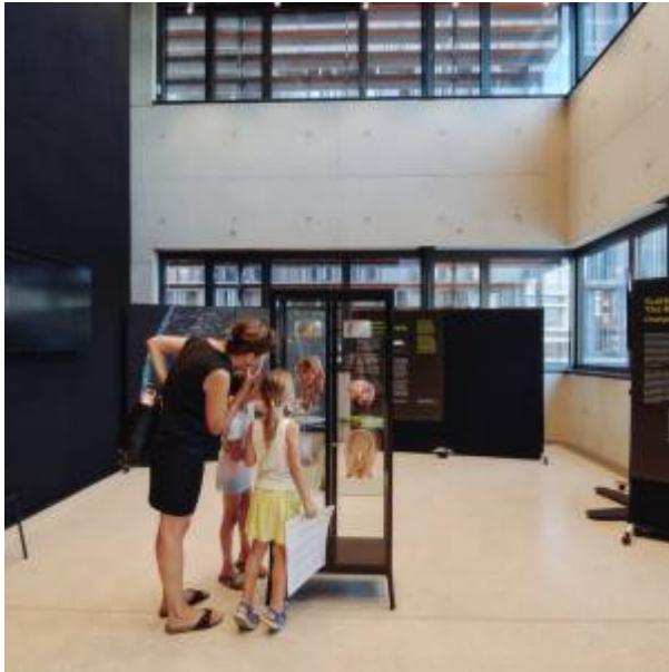
Touchingthoughts Fotodocu 65