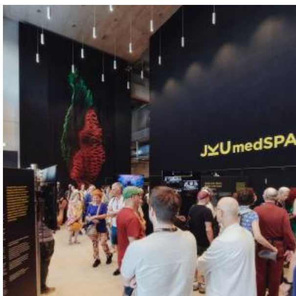
Touchingthoughts Fotodocu 32

These projects together with new images produced by the scientists and further documentation materials about the imaging protocols, are on display during Ars Electronica Festival at JKU MED Campus in two presentation sessions in the medSPACE and in an exhibition.