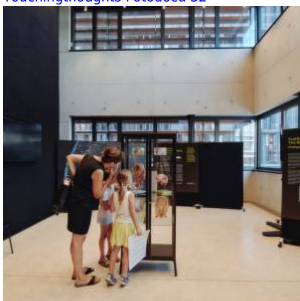
Touchingthoughts Fotodocu 65