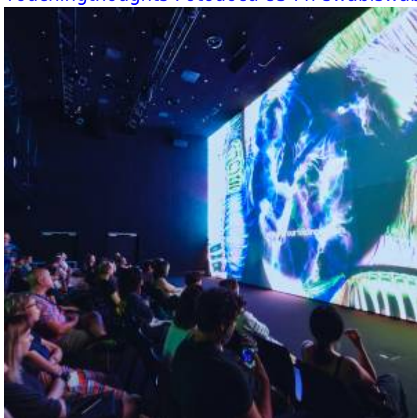
Touchingthoughts Fotodocu 91